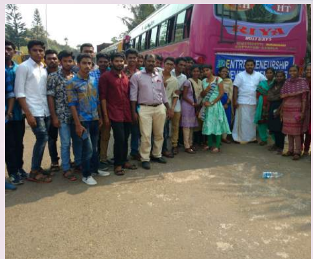
Students Participation in iDE PRENEUR at Viswajyothi College, Vazhakulam