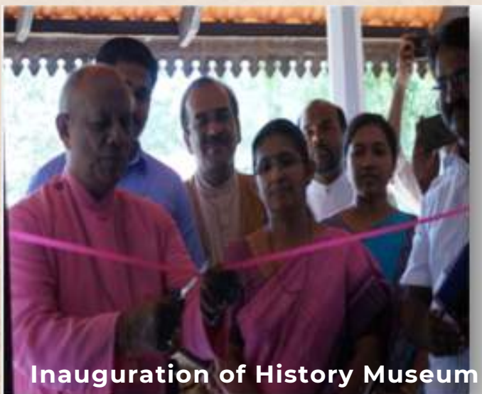
Inauguration of History Museum