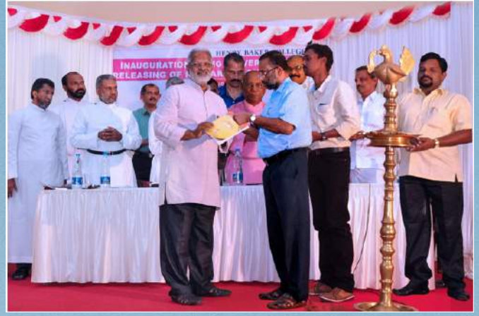
Releasing Research Journal Commerce and Management Review