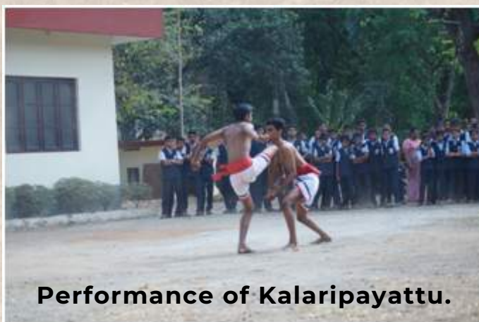
Performance of Kalaripayattu.