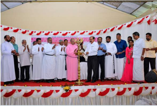
Inauguration of Commerce Research Centre