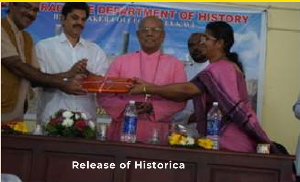
Release of Historica